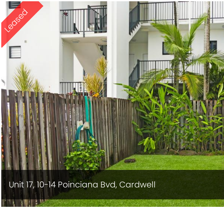
Unit 17, 10-14 Poinciana Bvd, Cardwell