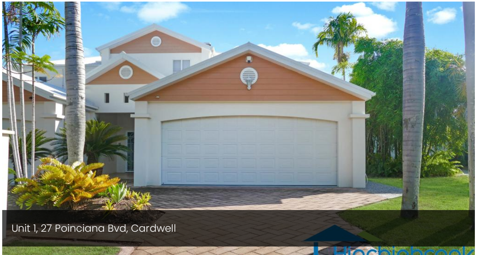
Unit 1, 27 Poinciana Blvd, Cardwell