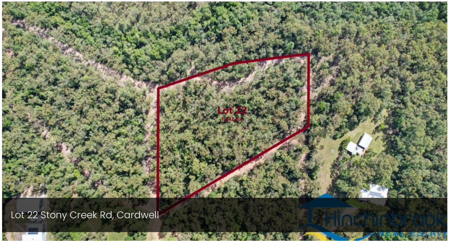
Lot 22 Stony Creek Rd, Cardwell