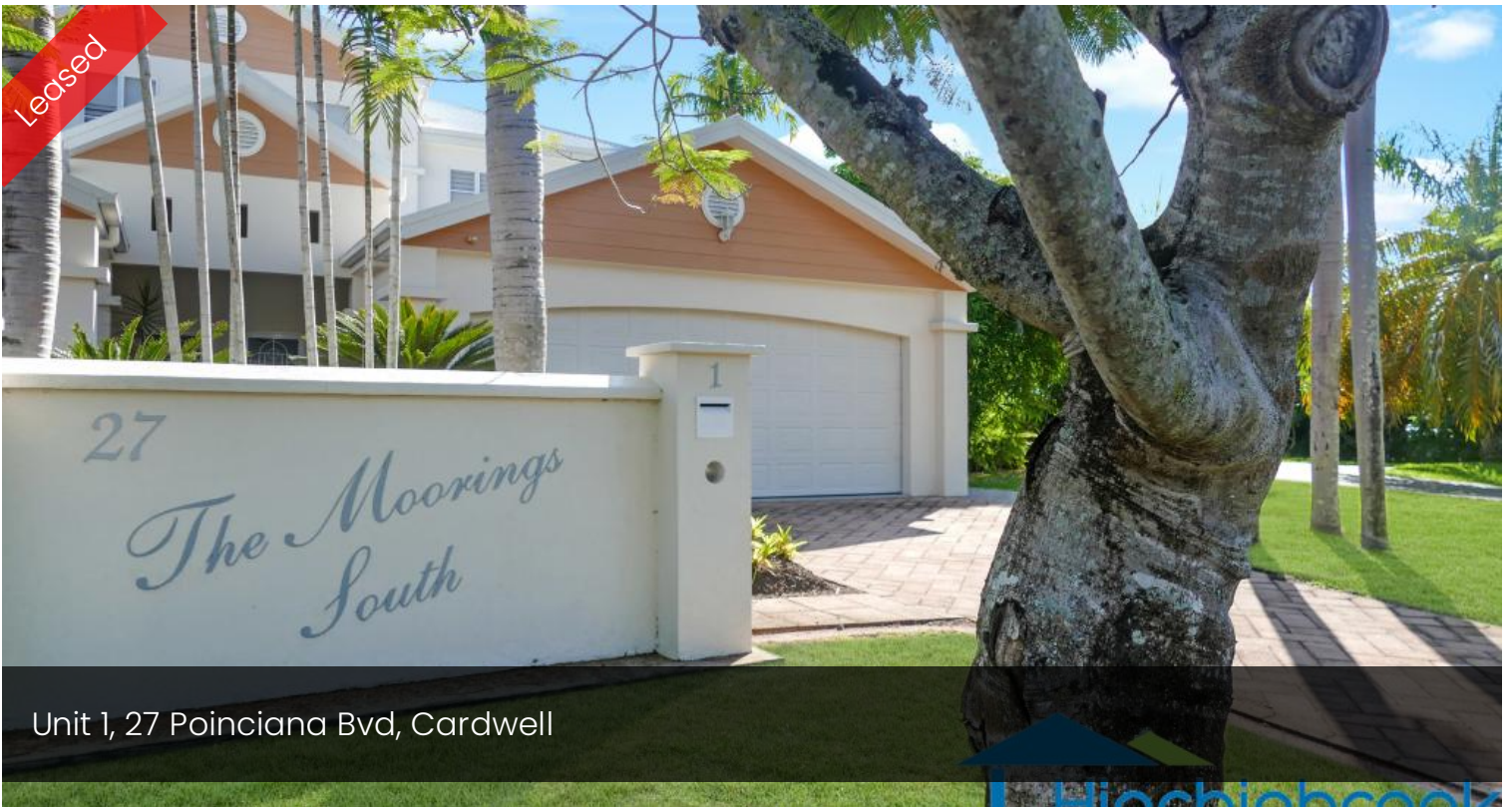
Unit 1, 27 Poinciana Blvd, Cardwell