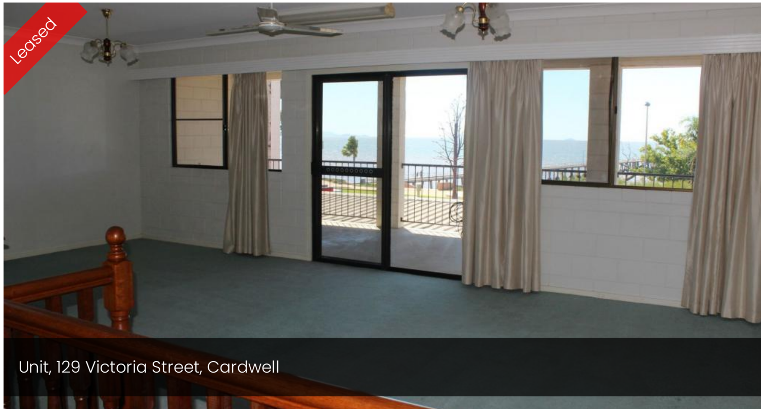
Unit, 129 Victoria Street, Cardwell