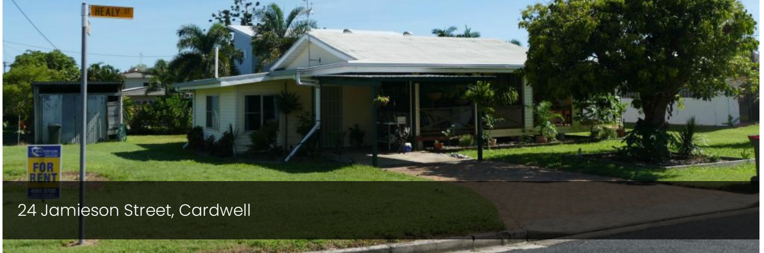
24 Jamieson Street, Cardwell