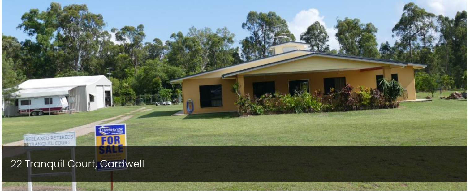
22 Tranquil Court, Cardwell