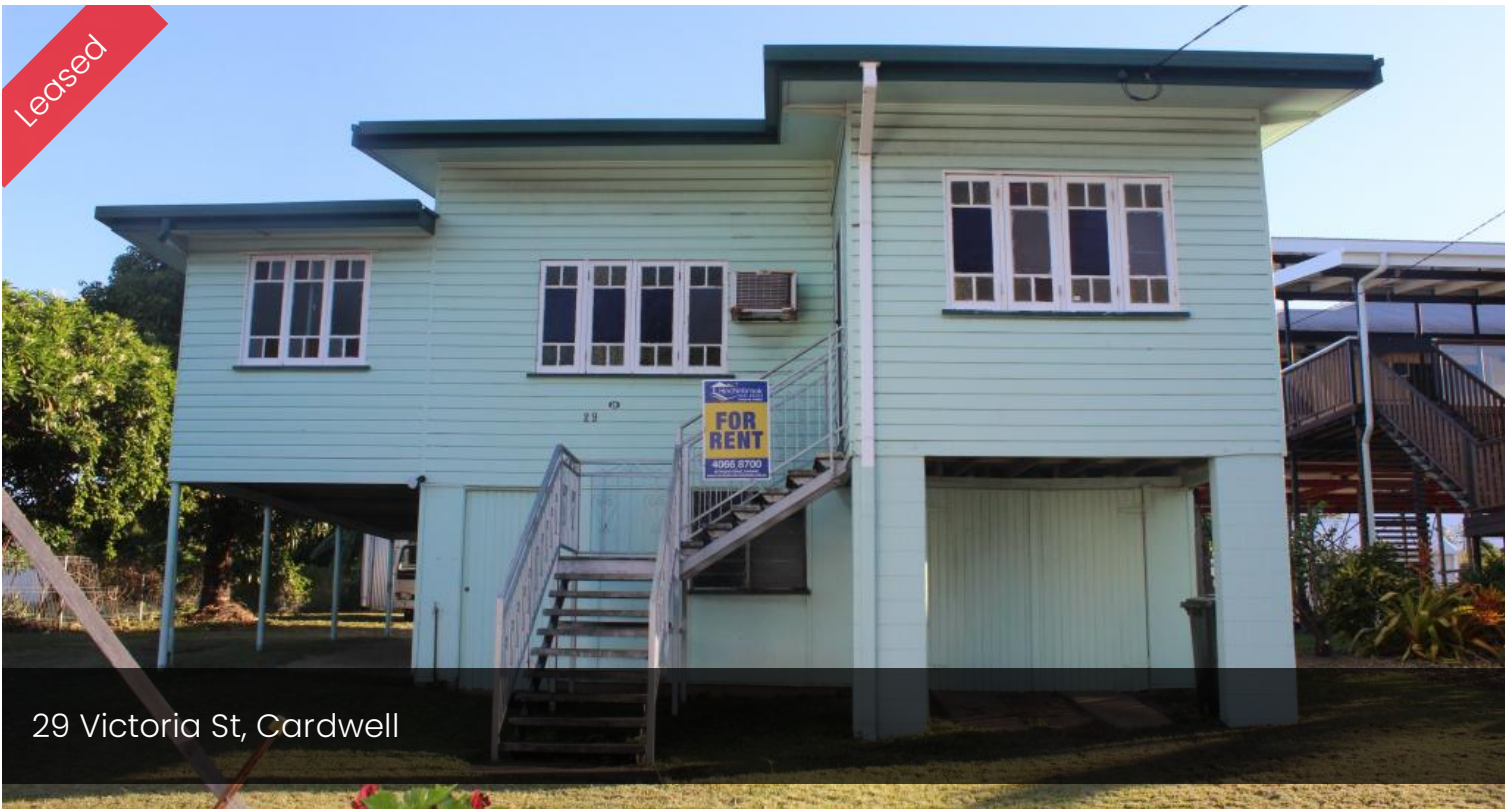
29 Victoria St, Cardwell