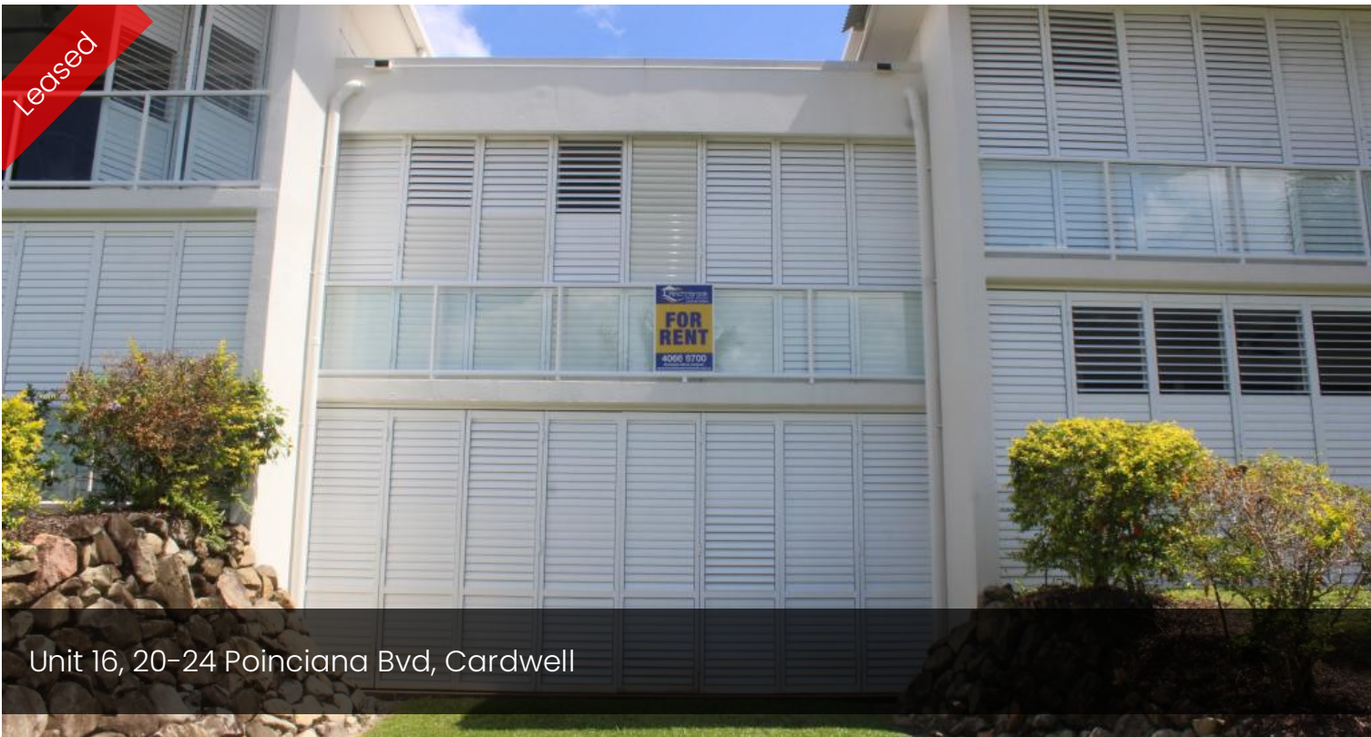
Unit 16, 20-24 Poinciana Bvd, Cardwell