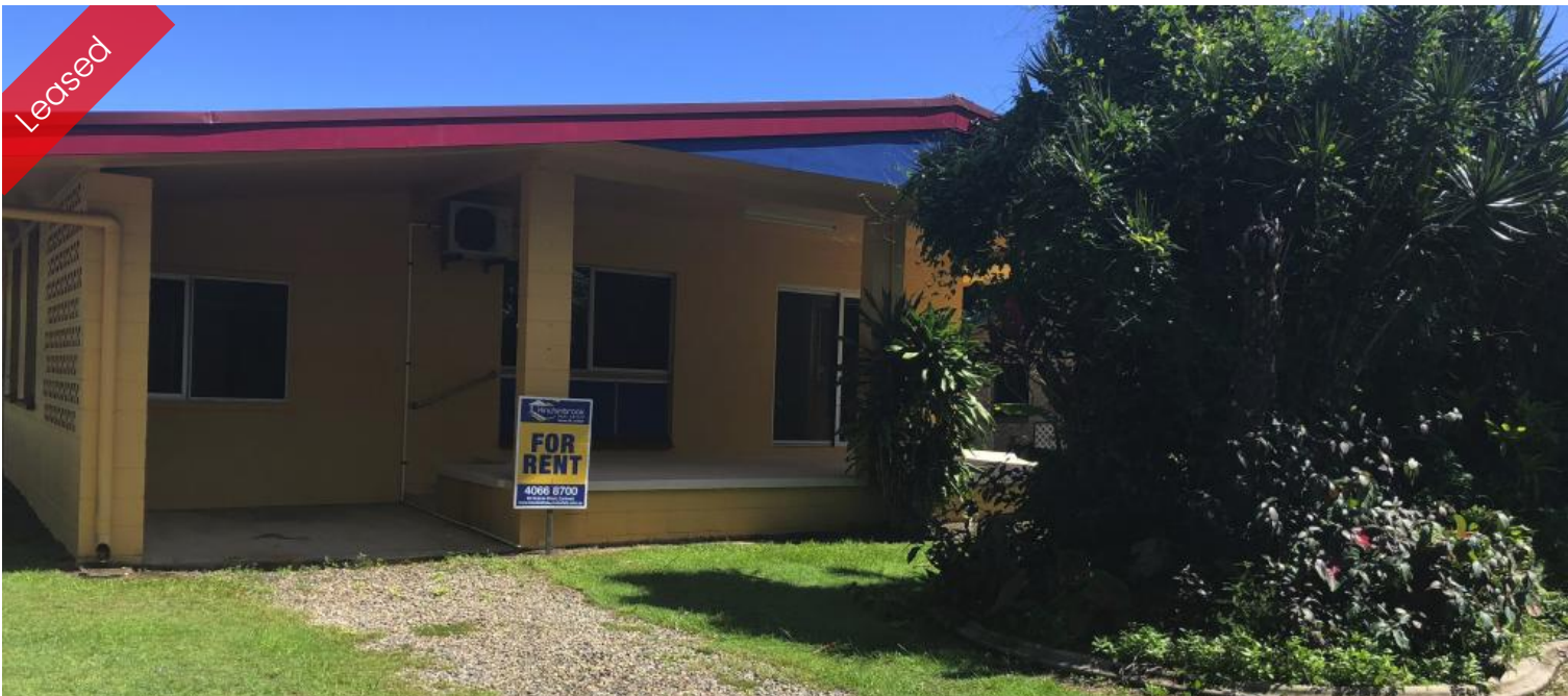
Unit 2, 10 Raleigh Street, Cardwell