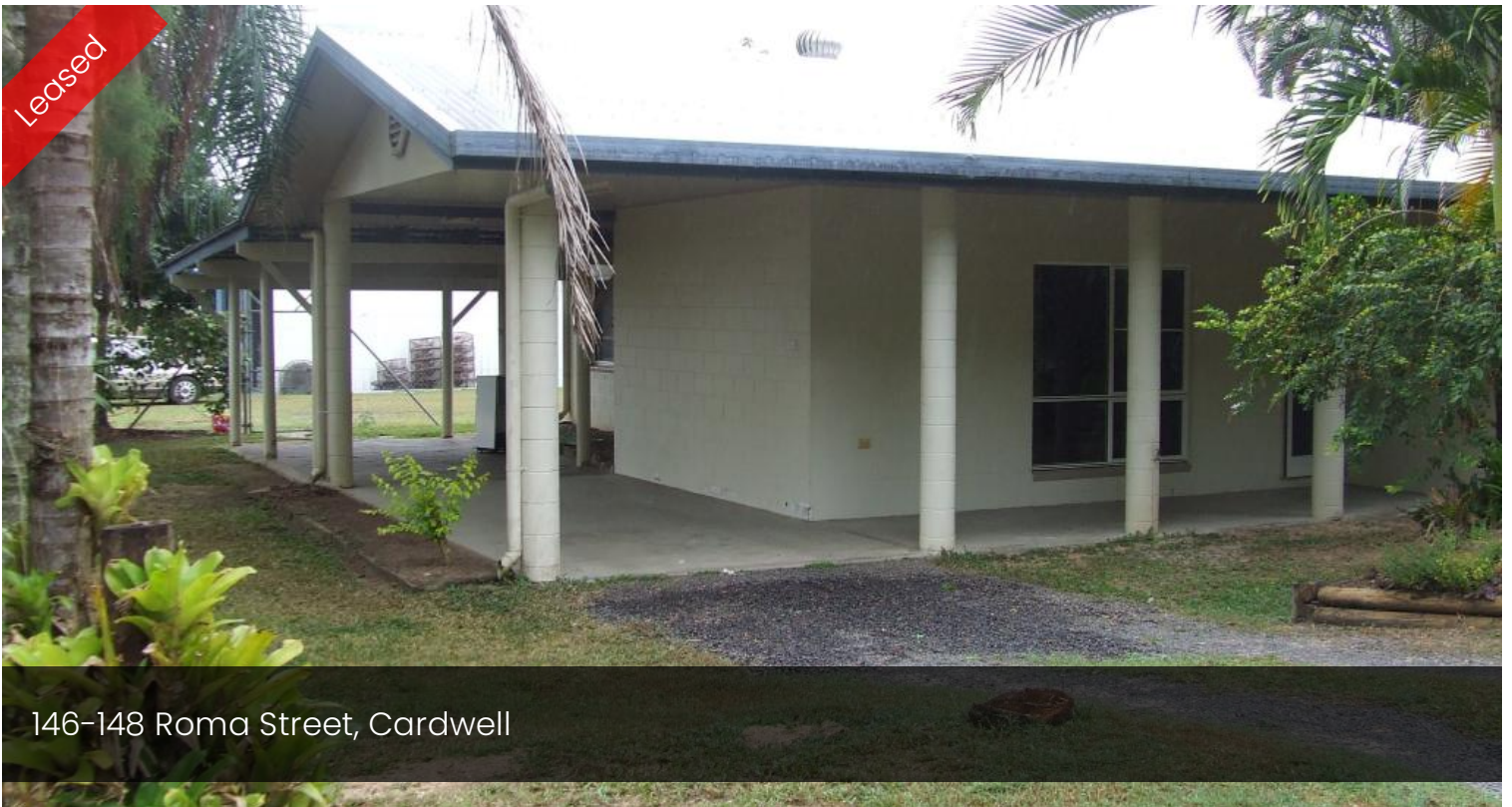
146-148 Roma Street, Cardwell