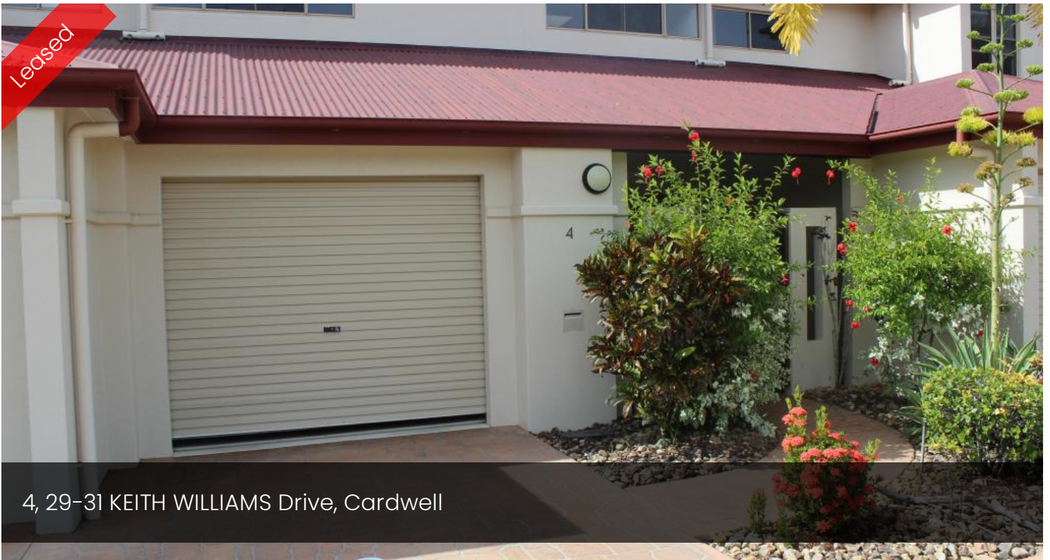
4, 29-31 KEITH WILLIAMS Drive, Cardwell