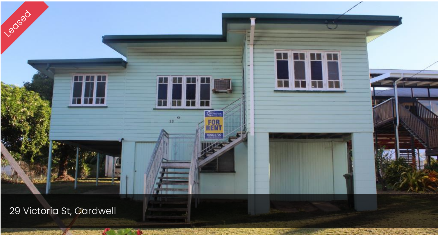
29 Victoria St, Cardwell