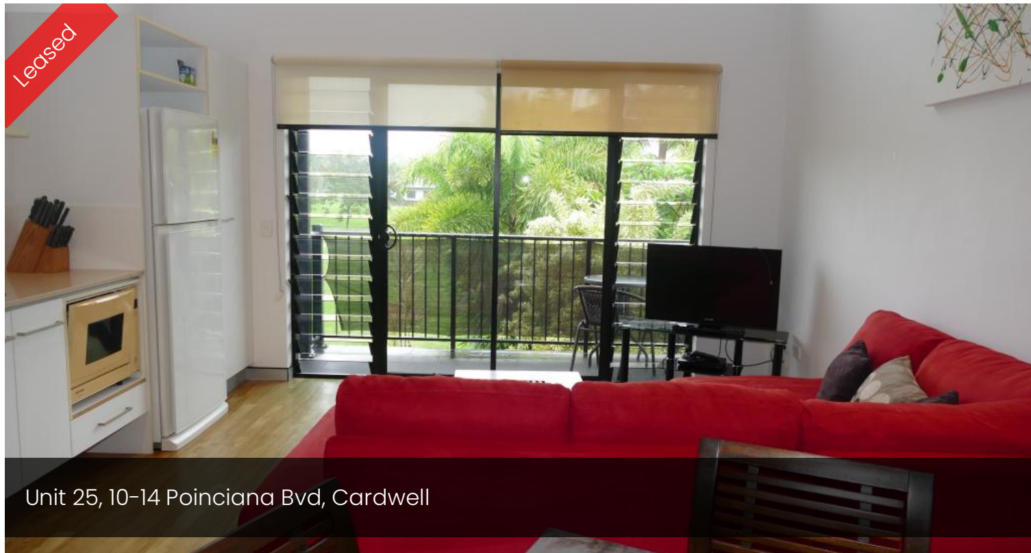
Unit 25, 10-14 Poinciana Blvd, Cardwell