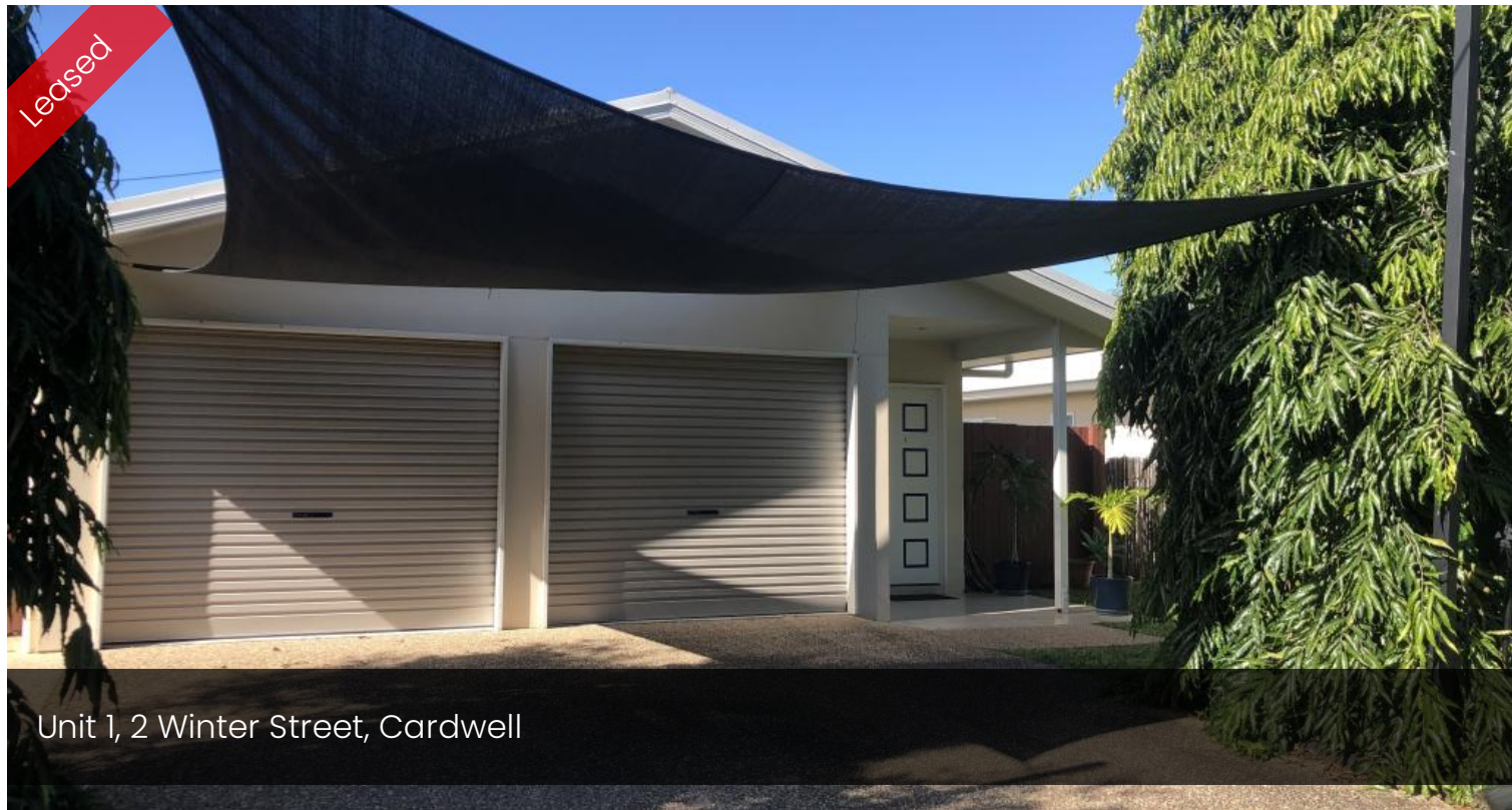
Unit 1, 2 Winter Street, Cardwell